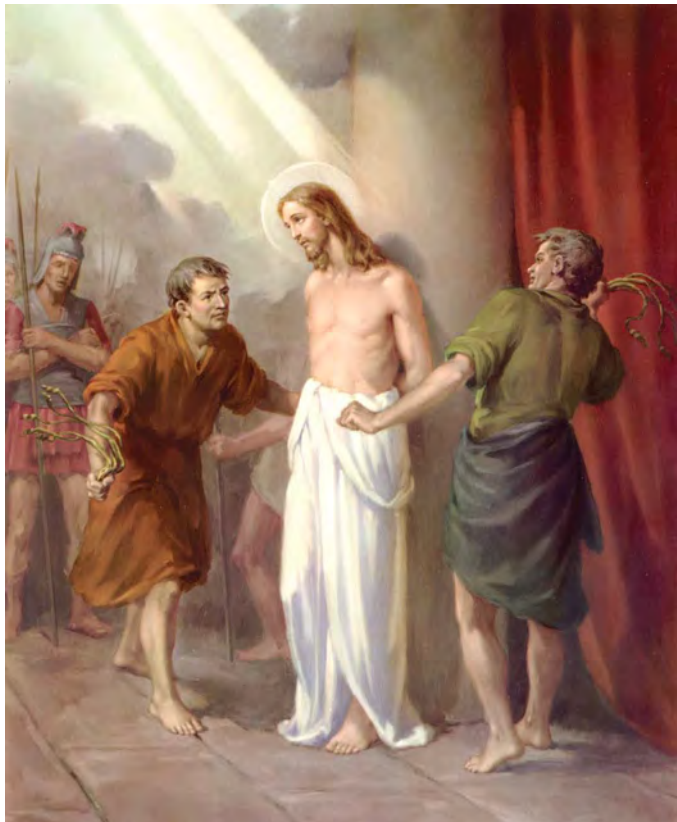
The Scourging at the Pillar