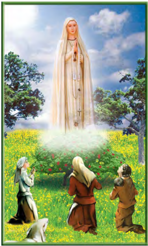
Our Lady of the Rosary of Fatima