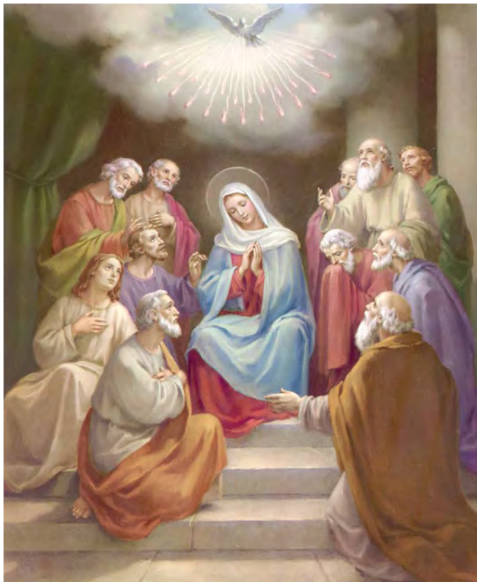
The Descent of the Holy Ghost